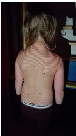
Figure 1. Position 1: habitual posture.

average time to go from the place of living given in the questionnaire completed by the parents [10]. On the other hand, the load mass was determined by averaging the weight of school items carried by 1 st grade children from a randomly selected primary school with the burden of 4 kg. Selected features of body posture were measured in 8 positions, 4 for each way of carrying. The first position - habitual position, figure 1. Second position - posture after 10 minutes of asymmetric oblique loading (in the last 5 seconds), figure 2. Third position - posture one minute after the load removal, figure 1. Fourth position - posture two minutes after the load removal, figure 1. The load was supposed to imitate the way of carrying school supplies. The subject could move freely. Thereby, there were attempts made to exclude the overlapping of postural muscle fatigue from one position to another during the examination. This is in line with the results of Mrozkowiak's research, which shows that after this time the features can take the initial values [11]. The children's height and weight as well as the weight of the carried school supplies were measured with a medical balance before the first day of the tests.